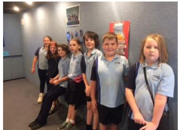
Some of our students enjoying their Life Education experience