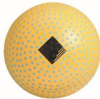
Mighty Boom Handball